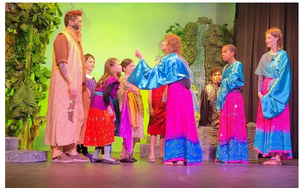
Jungle Book 2024