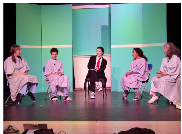
Night of Drama 2024

Props, costumes, and set materials cost about $1,000. Marketing (posters, fliers, etc.) adds another $400. Finally, production rights can range from $700 (for a play) to over $3,500 (for a musical). Your generous donation will help us continue to provide opportunities for our community members to shine, while creating the absolute best quality theatre for our audiences. To help and donate, please click on the Venmo link .